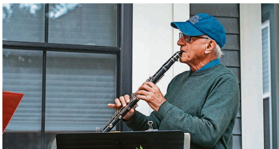
A member of Tin Roof plays the clarinet at Porchfest.