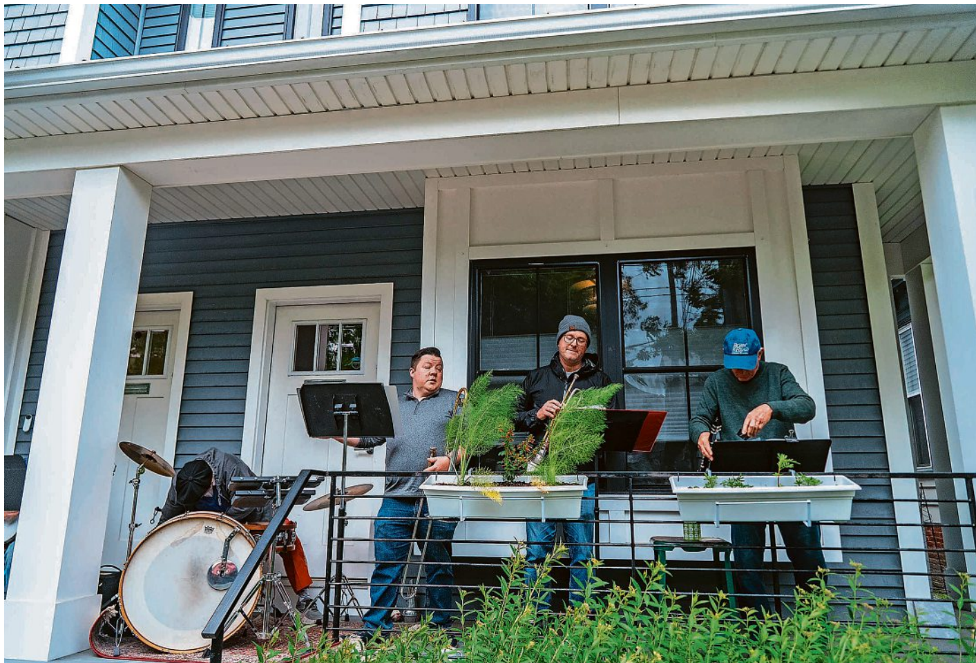
Tin Roof performs 1920s jazz on a porch on Hope Street during Porchfest. Music spanning from punk rock to children's music could be heard from houses on Providence's East Side.