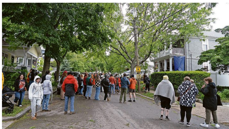
Crowds gather on a street on Providence's East Side to listen to a band during this year's Porchfest on May 30. This was the fourth year of the festival.

The event was organized by volunteers in the neighborhood.