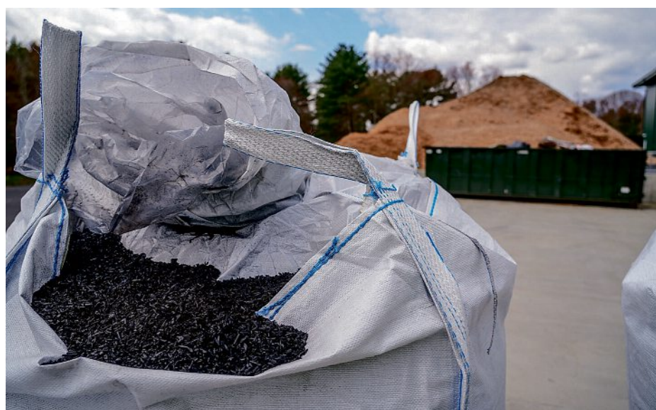
A finished and bagged carbon-rich soil amendment made from wood chips by Quonset Soil Solutions' pyrolysis facility is shown on April 20.

emissions, say representatives of Quonset Soil Solutions, an affiliate of the Cranston-based renewable energy company Green Development.