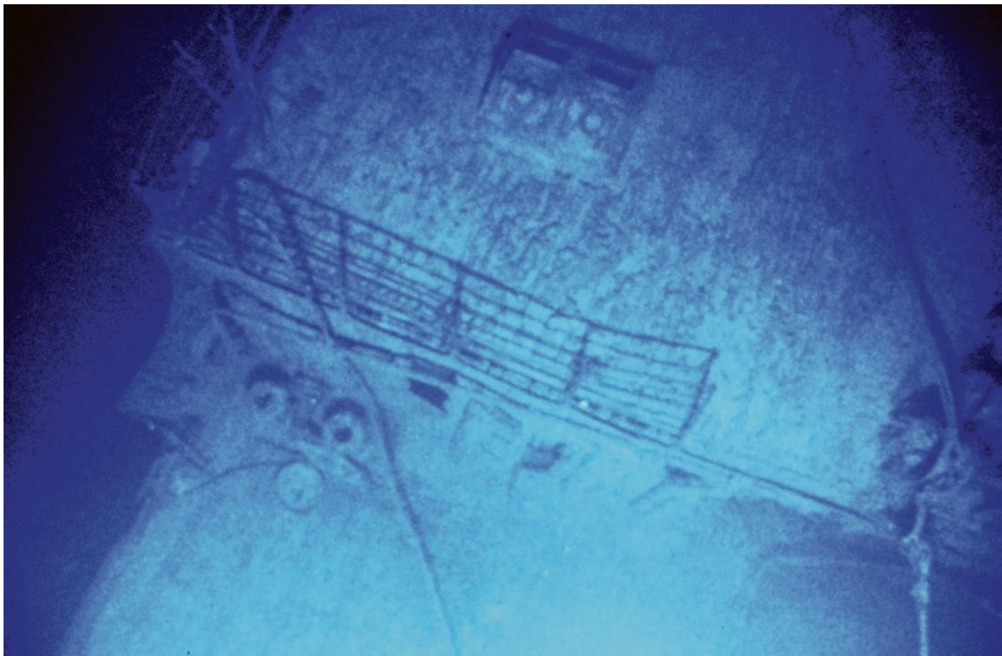
The tow vehicle Angus captured the first images of the RMS Titanic on the ocean floor in 1985. Since teams discovered its final resting site, the railing of the iconic bow has collapsed.