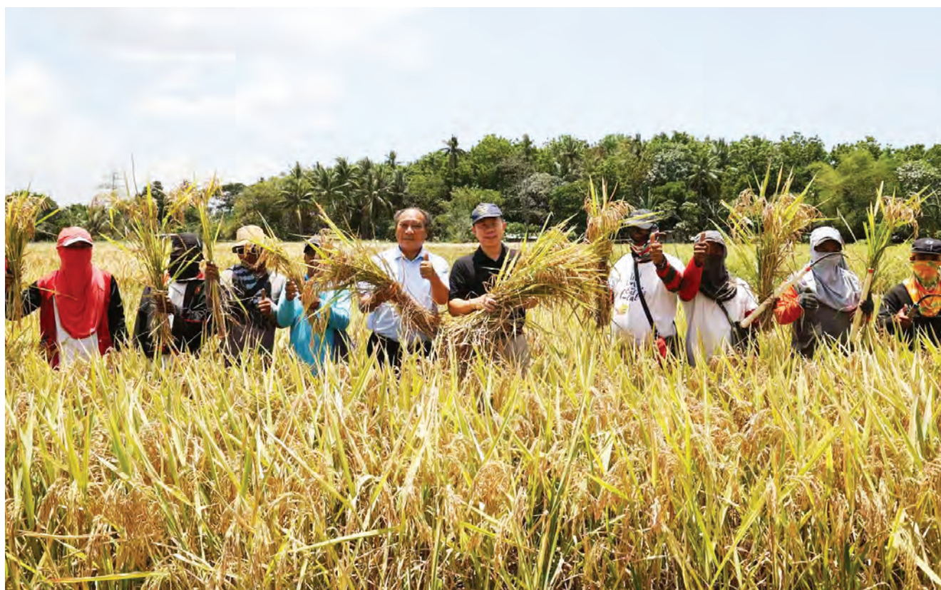
RICE AND SHINE – China's Ambassador to the Philippines Jing Quan (middle, in black cap) gives the thumbs-up sign with farmers while holding harvested rice in Sta. Cruz, Laguna, on April 16, 2026, to highlight the successful localization of Chinese hybrid rice technology in the country.

A fragile ceasefire is due to run out by Wednesday. Iran ▶7