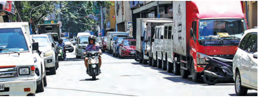
TRAFFIC BUSTER – Vehicles are shown parked on both sides of Escolta Street in Sta. Cruz, Manila, on Sunday, August 3, 2025. The Department of the Interior and Local Government (DILG) and the Metropolitan Manila Development Authority (MMDA) on Friday suggested a parking ban in major streets to ease the worsening traffic situation in the National Capital Region (NCR).