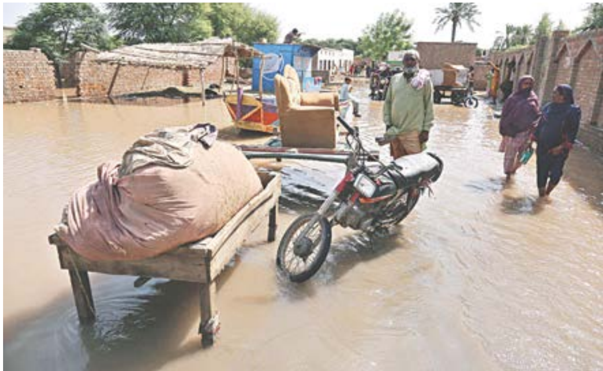
MUZAFFARGARH: Flood-affected villagers gather their belongings as they wait to be rescued.—APP