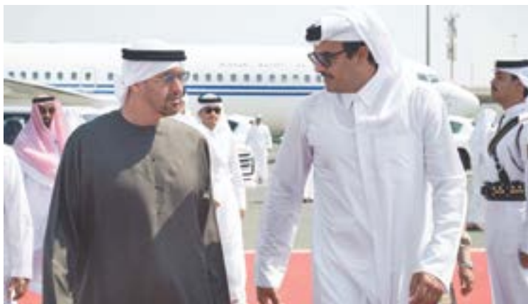
UAE President Sheikh Mohamed bin Zayed Al Nahyan walks alongside Qatari Emir Sheikh Tamim bin Hamad Al Thani at Doha International Airport.

the Israeli aggression, Qatar was reassessing everything about its mediating role in the Gaza conflict — as well as Hamas' future on its territory.