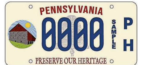
New Pennsylvania Preserve Our Heritage license plate featuring a bank barn.

The special fund license plate is available for cars or trucks with a registered gross weight of not more than 14,000 pounds. Each plate costs $64, with $23 going directly to support the Pennsylvania Historical and Museum Commission's education and exhibit programs. Pennsylvanians who are interested in ordering this new plate can