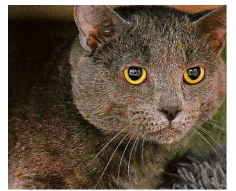
Max, a 2-year-old male domestic shorthair cat, is available for adoption at York County SPCA in Manchester Township.