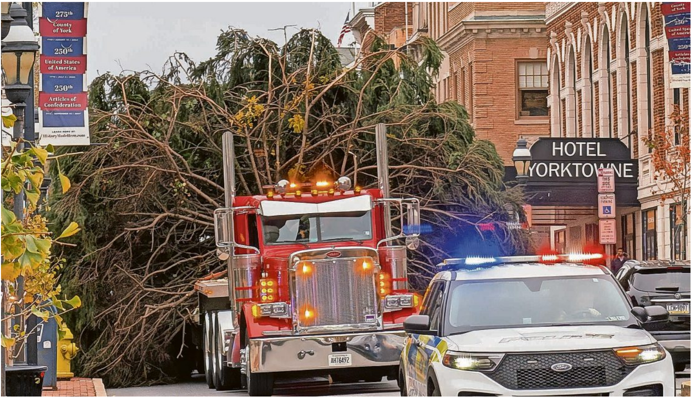
The York Christmas tree passes the Yorktowne Hotel on its way to Continental Square Nov. 12.