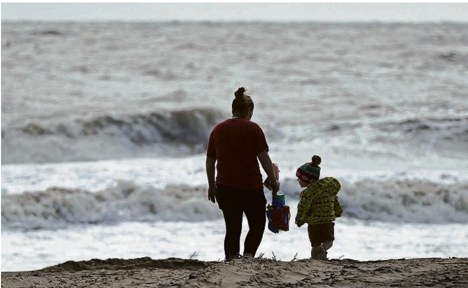
Choppy seas batter Tybee Island near Savannah, Georgia, as Hurricane Milton moves out into the Atlantic in 2024.

The Main Development Region, located between the Caribbean and Africa, is a region in the Atlantic where many tropical cyclones – tropical storms and hurricanes – form. This area is key because it's where many tropical waves, which can develop into hurricanes, originally form. The warm water in that key region is just one of the reasons hurricane forecasters are warning that hurricane season could soon heat up. Warm water everywhere It's not only the Main Development Region that's warm: Water across the Gulf of America (also known as Gulf of Mexico) and the Caribbean Sea are also above average, scientists said. See HURRICANES, Page 3A