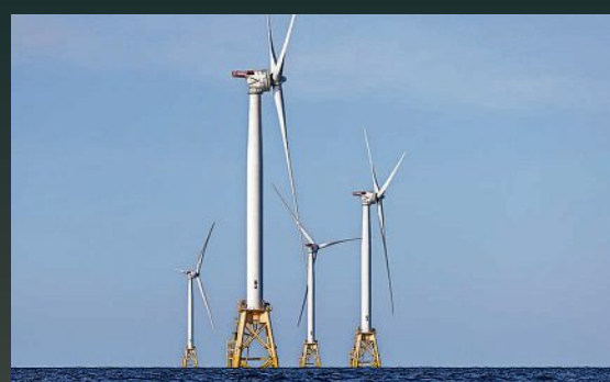
▲ Developing a robust offshore wind industry provides resilience in the face of an unstable global energy market, particularly as future U.S. and global energy demand is projected to grow significantly.