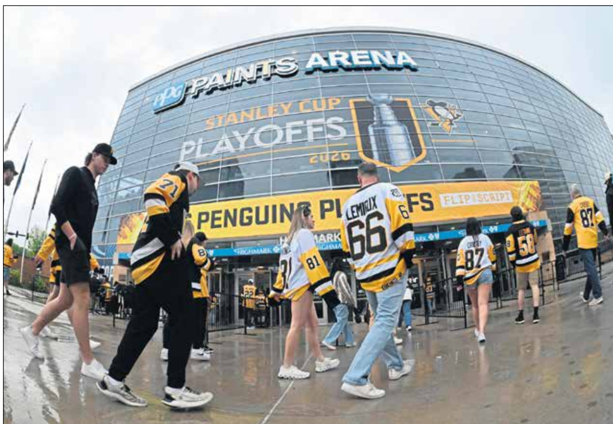
Fans enter PPG Paints Arena on Saturday for Game 1 of the Penguins-Flyers first-round series in Pittsburgh. Find game coverage on B1 and at TribLive.com.