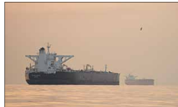
Merchant tankers wait at anchor Saturday in the Strait of Hormuz off the coast of Qeshm Island, Iran.