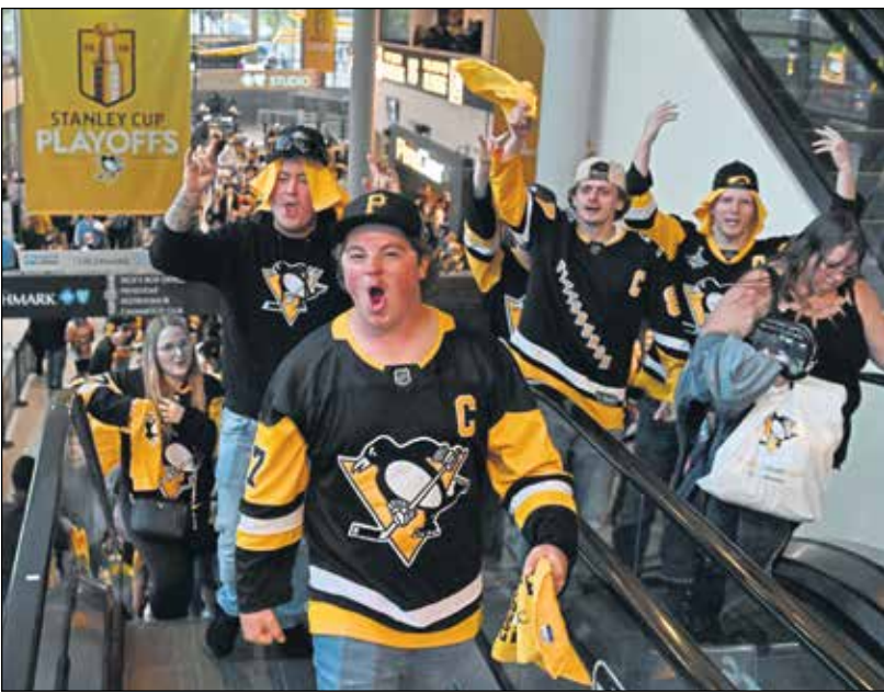
Penguins fans were thrilled to see their team in the playoffs for the first time in four years, and the Pens-Flyers rivalry amped up the excitement.

cross-state rivalry took a negative turn — off the ice. Penguins and Flyers fans continuously booed and yelled at each other while walking around inside the arena.