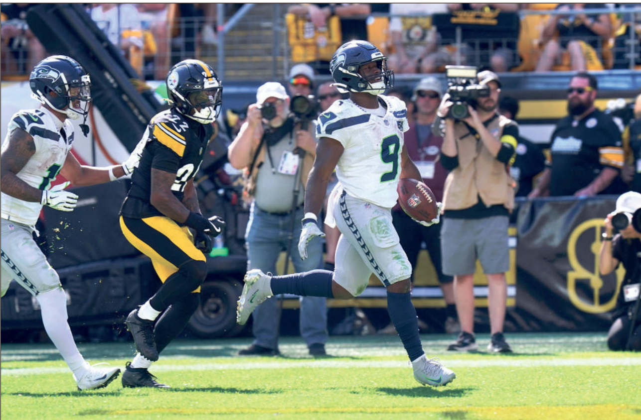
Seattle Seahawks running back Kenneth Walker III (right) scores a touchdown during Sunday’s game against the Pittsburgh Steelers, with Steelers safety Juan Thornhill in pursuit. The Steelers’ offense failed to find its rhythm, and the Seahawks took advantage of some sloppy play to pull off a 31-17 surprise win in Pittsburgh. Check out full coverage of the game in Sports/B1.

Shapiro, state prepare to mark terror attacks’ 25th anniversary in ‘26