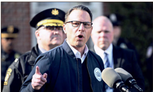
Gov. Josh Shapiro speaks April 13 about an arson fire set at the governor’s residence in Harrisburg.

Political leaders confronting security concerns – and fear