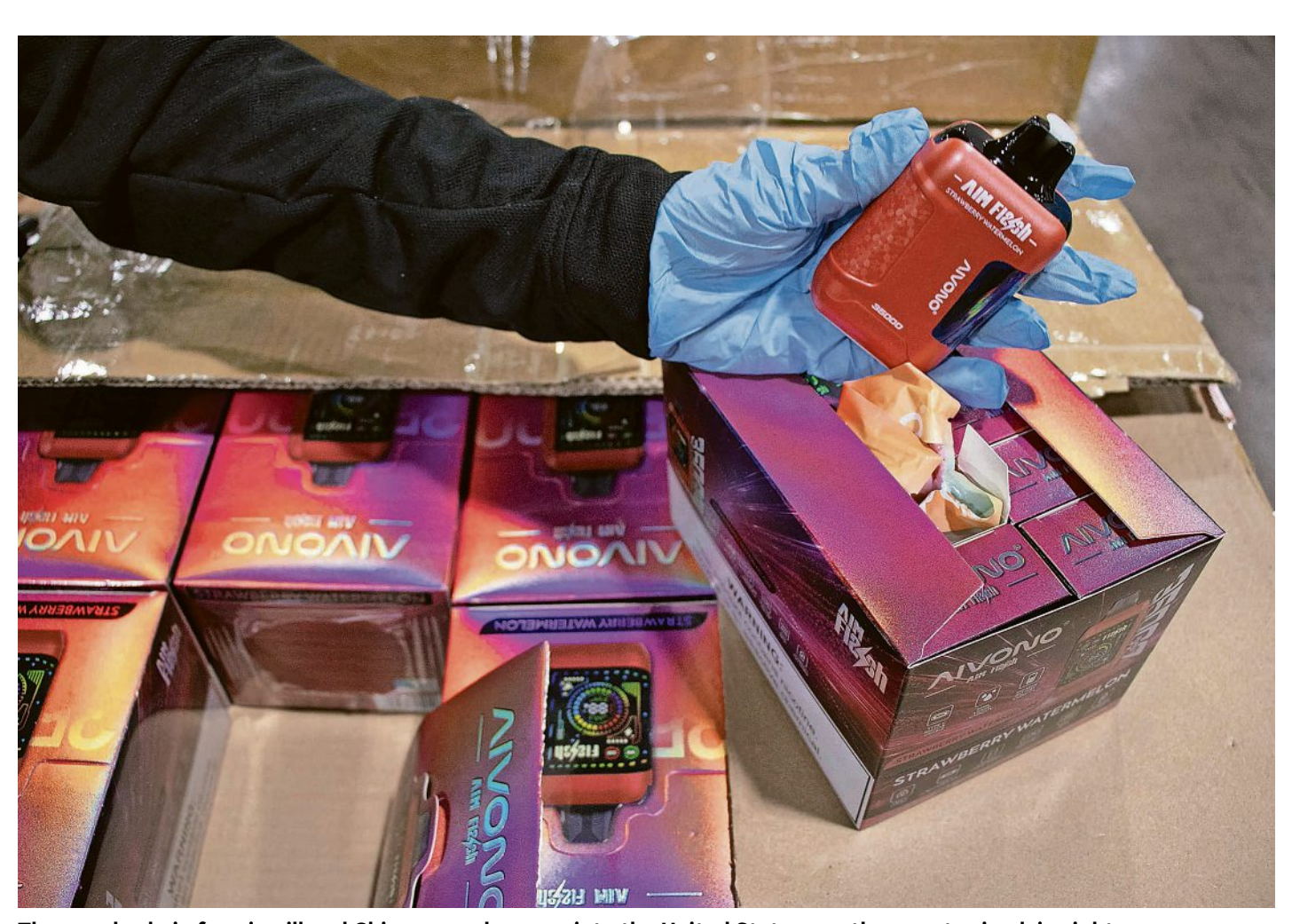
The supply chain ferrying illegal Chinese-made vapes into the United States mostly operates in plain sight.