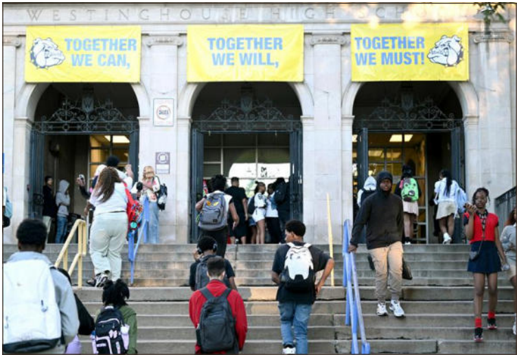
Westinghouse Academy students enter the school Monday.