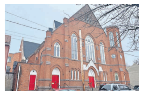
Thieves stole copper piping and HVAC units from Bethel AME Church in Harrisburg, leaving the building without water or electricity.

Donations can be made here through gofundme.com/f/help-restore-bethel-ame-church .