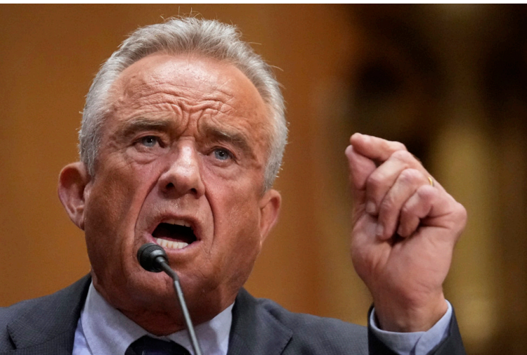
Secretary of Health and Human Services Robert F. Kennedy Jr. appears before the Senate Finance Committee on Thursday, where he faced bipartisan skepticism.