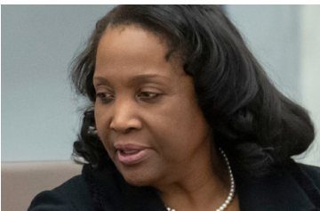
Lisa Cook is facing mounting legal and political pressure as a member of the Federal Reserve.

The Justice Department has opened a criminal mortgage fraud investigation of Federal Reserve Board member Lisa Cook, a sharp escalation of the Trump administration's