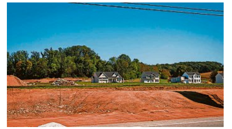
New homes in the Cambrian Hills development are seen along Ledger Drive, Oct. 9, 2025, in Berwick Township.