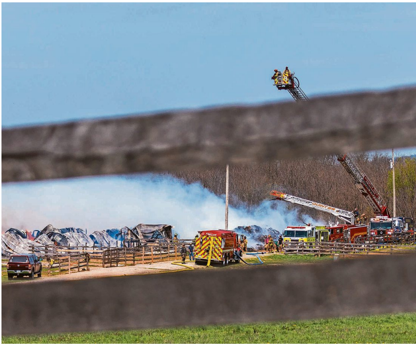
Firefighters work at the scene of a horse barn fire at the Hanover Shoe Farms on the 1000 block of Sells Station Road, April 12, in Union Township. 12 horses died in the fire, according to the farm.