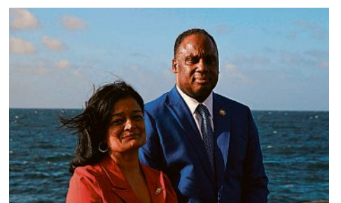
Democratic Reps. Pramila Jayapal of Washington and Jonathan Jackson of Illinois visit Havana on April 4.