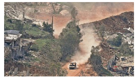
An Israeli military vehicle drives in Lebanon on April 26. Its military issued new evacuation orders in the southern part of the country.