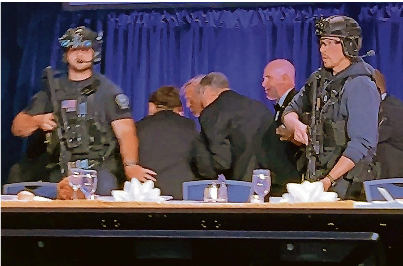
President Donald Trump is escorted out after shots were heard during the White House Correspondents' Association dinner on April 25.