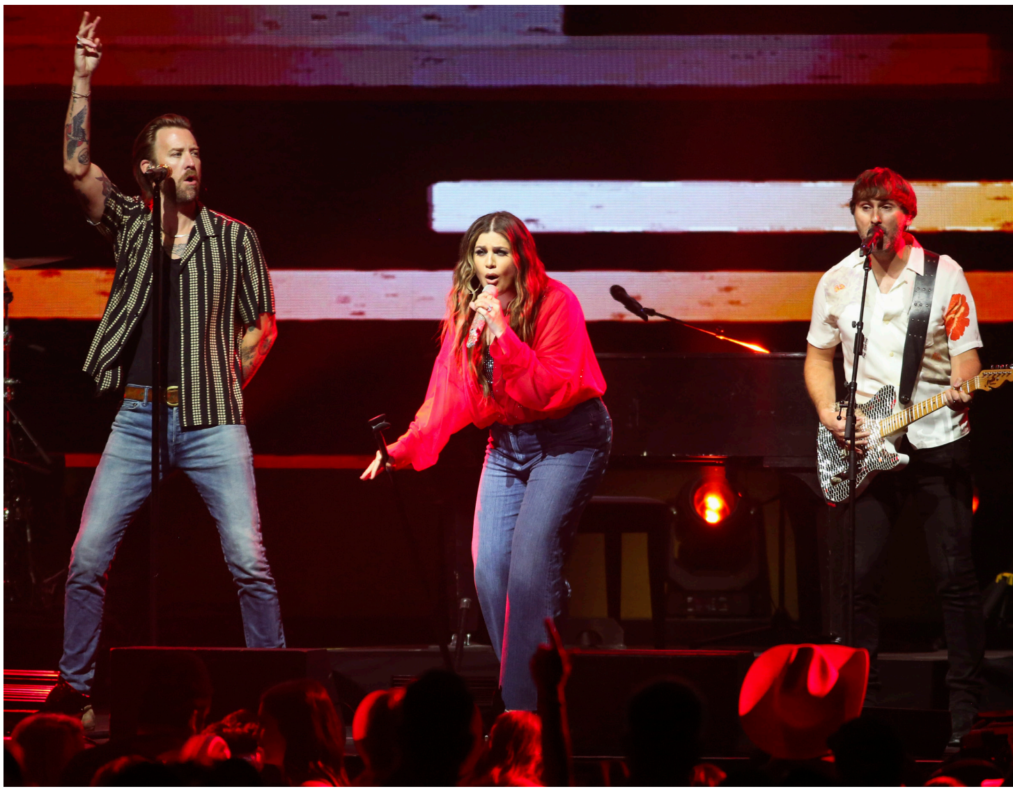
From left, Lady A's Charles Kelley, Hillary Scott and Dave Haywood perform during the iHeartCountry Festival on May 4, 2024, at The Moody Center in Austin, Texas.

Lady A, En Vogue headlining free concert at Kirby Park on June 20