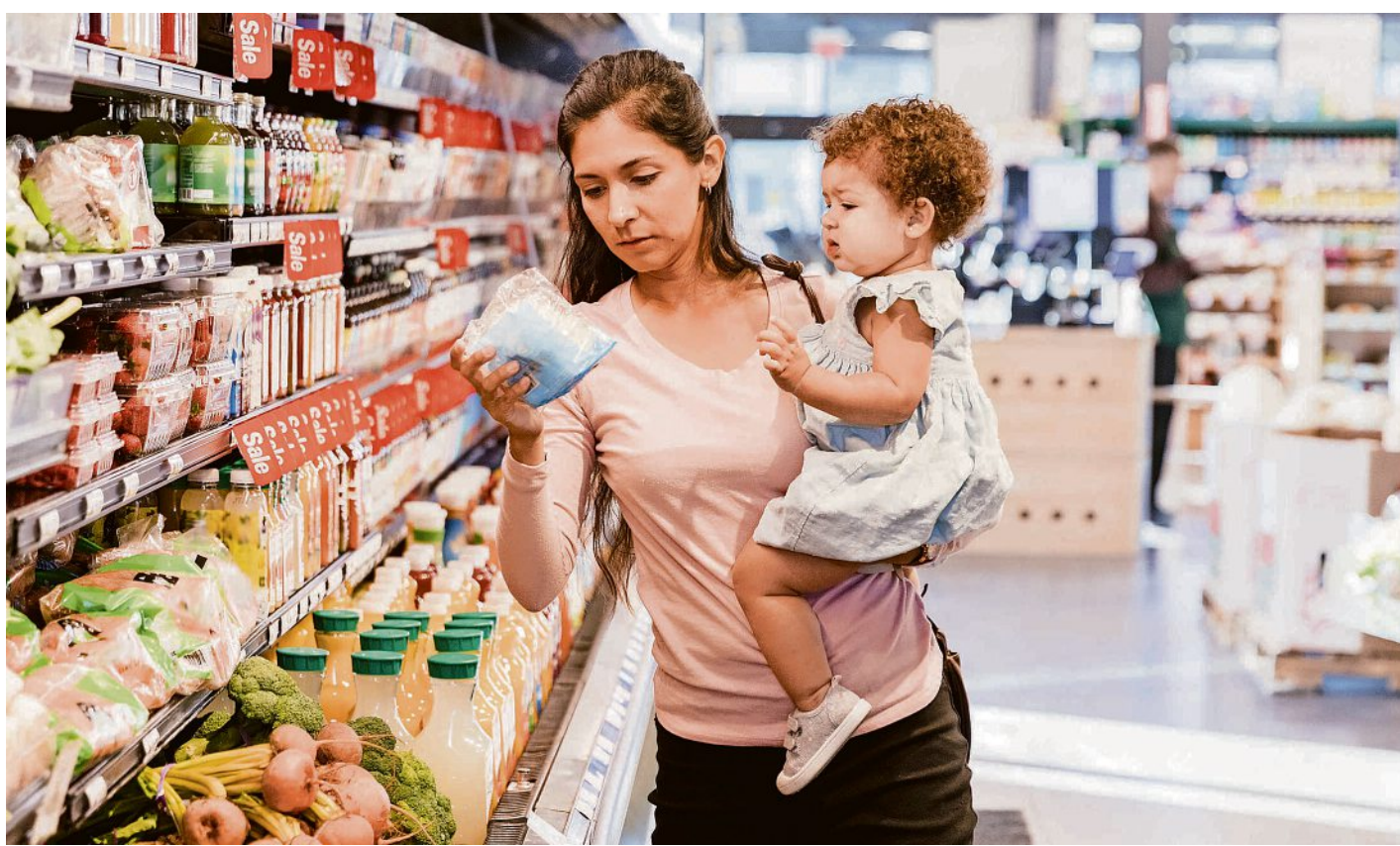
SNAP-Ed taught people how to identify healthy food patterns, keep food safe and navigate a complex food environment. It also taught low-income Americans how to improve their budgeting and planning for meals that balance cost and nutrition.