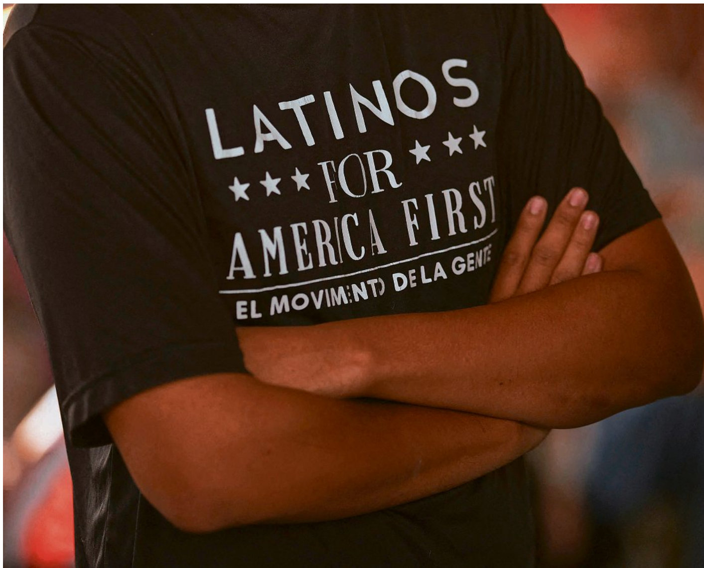
The majorities of Latino voters believe that their economic fortunes have declined since President Donald Trump returned to the White House. Moreover, they expect the situation to worsen over the next year. In March, The Economist reported that Trump's support among Latinos had fallen to 22%.