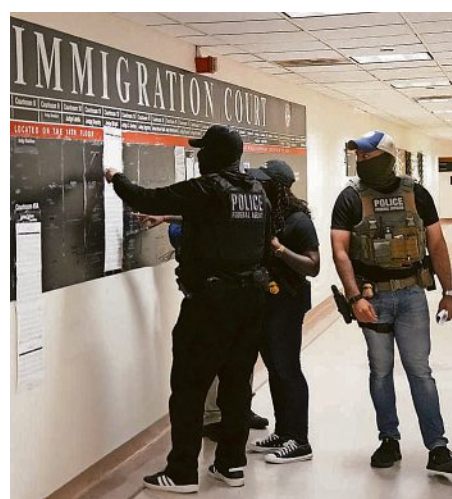
ICE agents look over lists of names and hearing times inside a courthouse before making arrests on June 27 in New York City. Latinos are overwhelmingly opposed to federal troops in U.S. cities, according to polling.