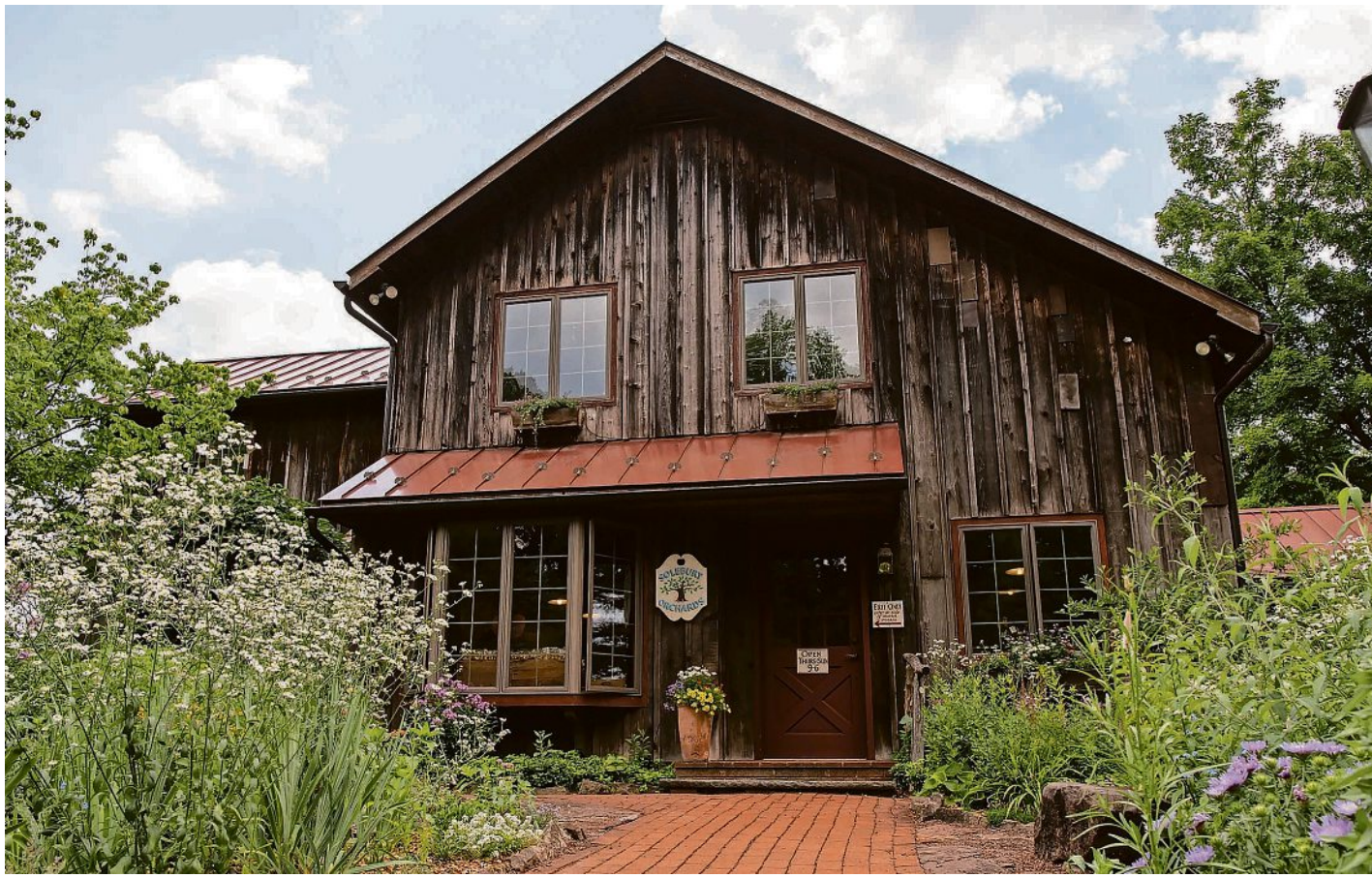
The market at Solebury Orchards will be stocked with seasonal fruit, some of which will be shipped in from other regions to supplement the significant loss in crops brought on by a late April freeze.