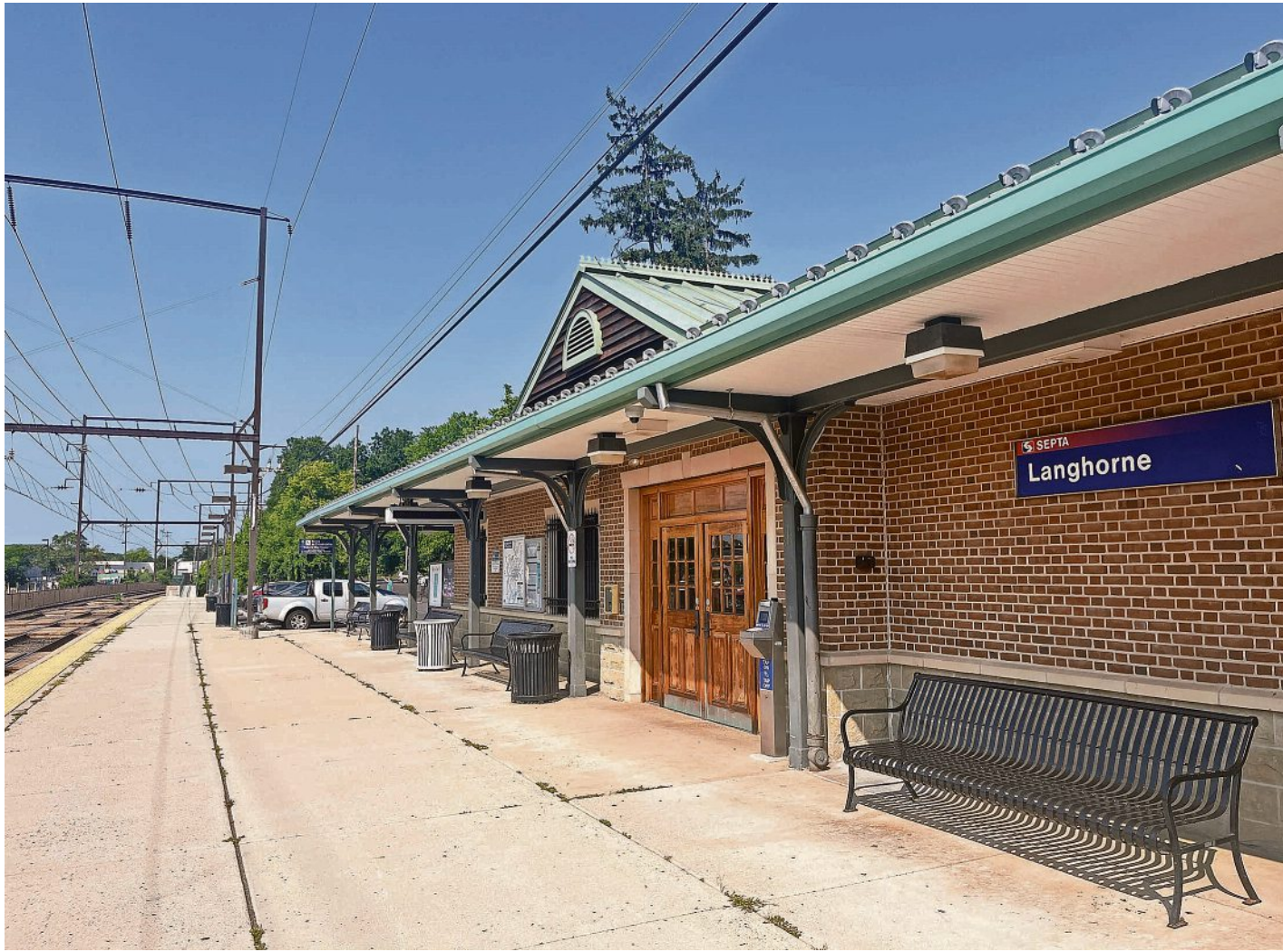
SEPTA officials said they're looking to redevelop the area around the Langhorne regional rail station with mixed-use retail and residential to better promote the area's walkability and help revitalize downtown Penn del nearby.