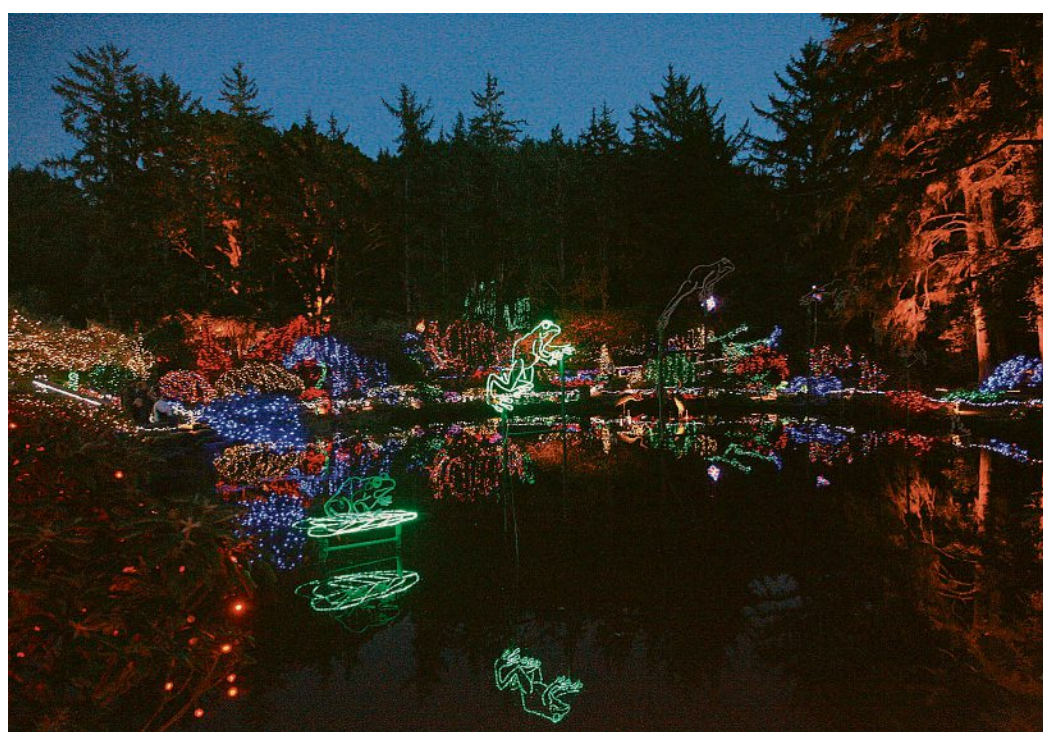
A lights display at Shore Acres State Park makes it popular during the holiday season.