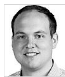
Joe Mussatto Columnist The Oklahoman USA TODAY NETWORK

The NBA playoff bracket is shaping up swimmingly for the Oklahoma City Thunder.