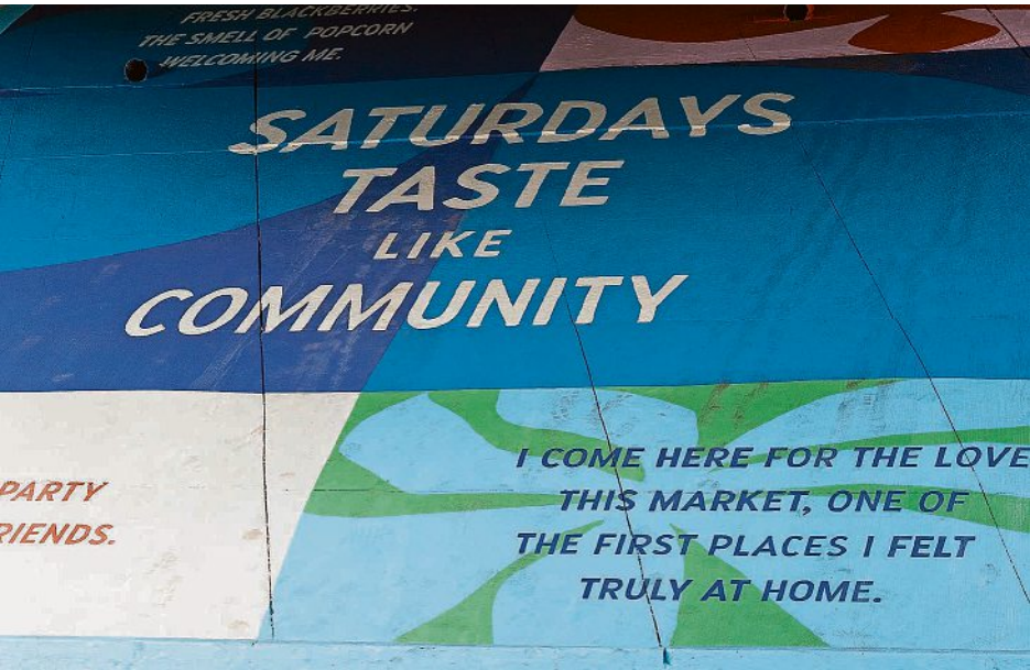
The recently completed mural under the Haymaker Parkway overpass in Kent includes pieces of poems written to celebrate Haymaker Farmers' Market's 30th anniversary in 2022.