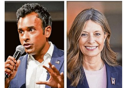
Ohio governor candidates Vivek Ramaswamy and Amy Acton.