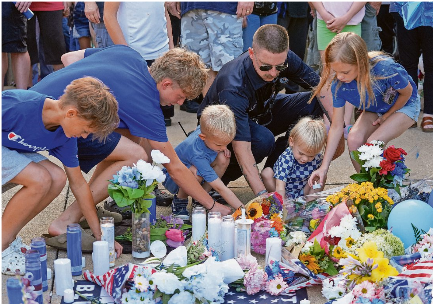
Members of the community lay candles and flowers during a candlelight vigil July 6 for Rittman Police Sgt. Scott Ries. Ries and two others were killed during a July 5 shooting in Rittman.