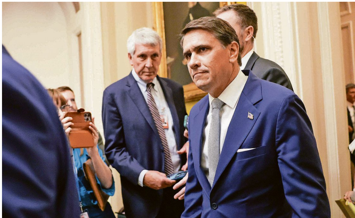
Acting Attorney General Todd Blanche was summoned to the Capitol to assuage lawmakers' concerns with what critics have characterized as a "slush fund."