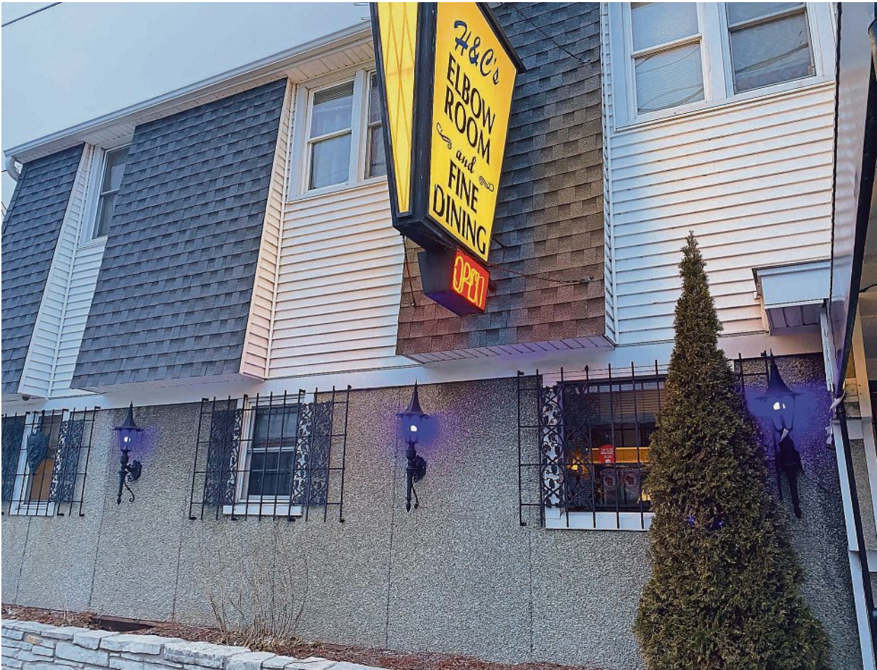
The outside of The Elbow Room on Buffalo Street in Manitowoc.