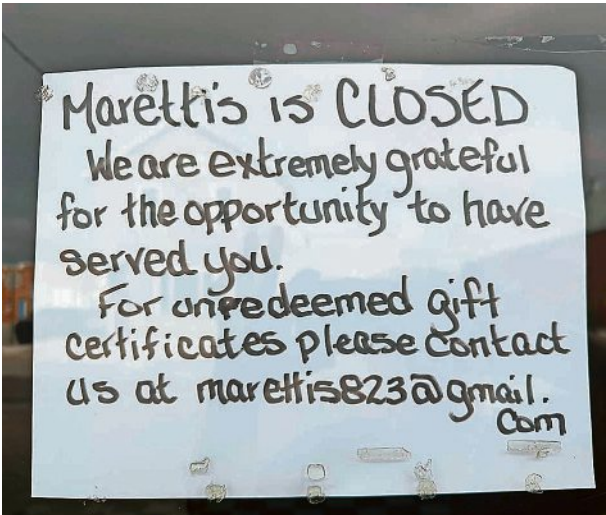
Maretti's Deli, 823 Buffalo St., Manitowoc has closed, as seen in late September 2025.