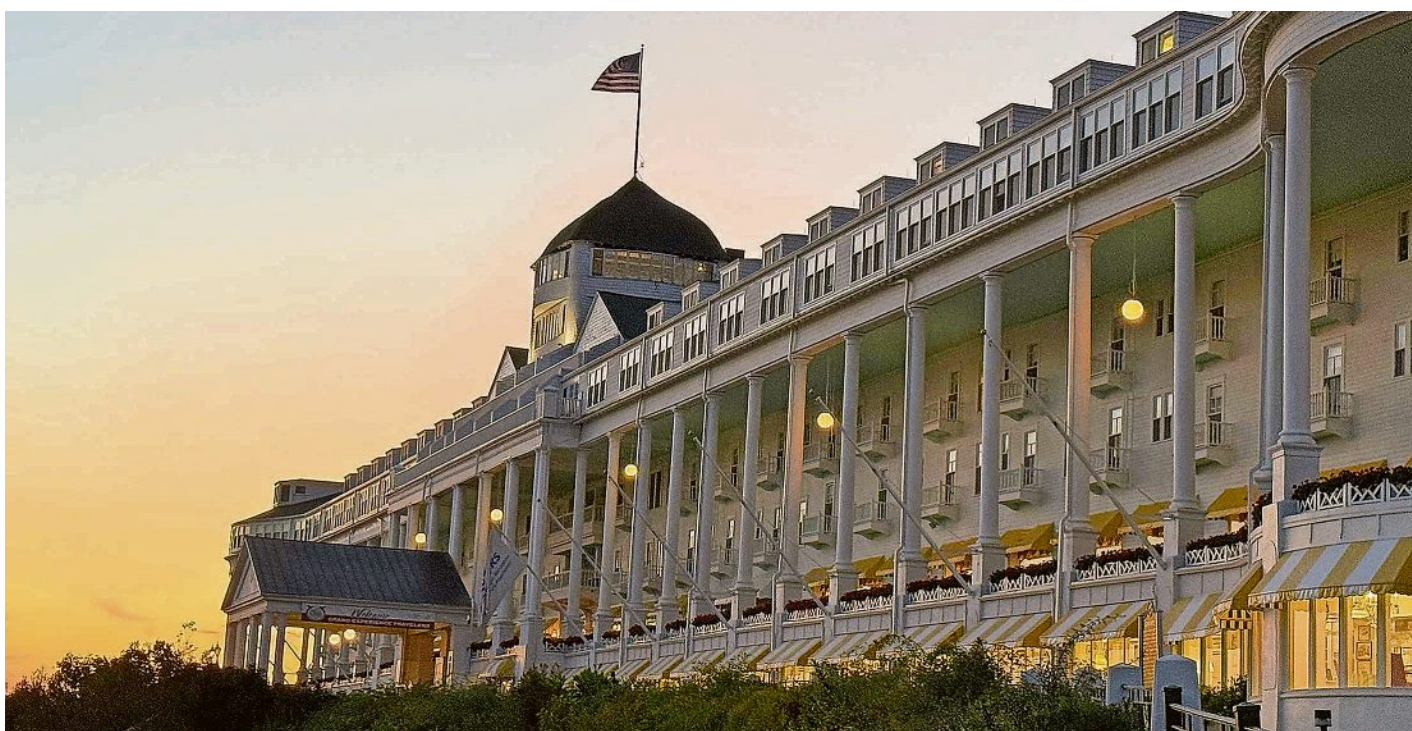
The Grand Hotel on Mackinac Island offers sweeping views of Lake Huron, the Mackinac Bridge and Mackinac Island's horse-drawn carriages.