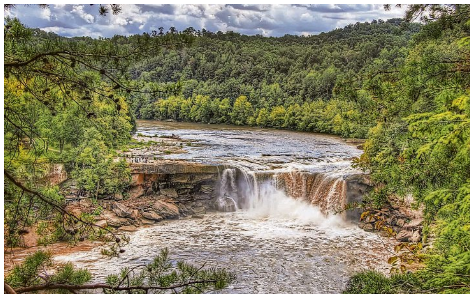
Cumberland Falls State Resort Park in Corbin, Kentucky, includes 17 miles of hiking and a majestic view the Cumberland Falls.