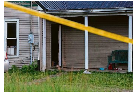
Home on the 100 block of Ohmer Street in Hamden, Vinton County, where state and county authorities say they rescued 16 children living in deplorable conditions, and arrested four adults on June 30 in Hamden.