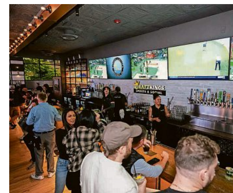
Guests enjoy watching sports on TV behind the bar at the grand opening of DraftKings Sports & Social in Columbus in 2024.