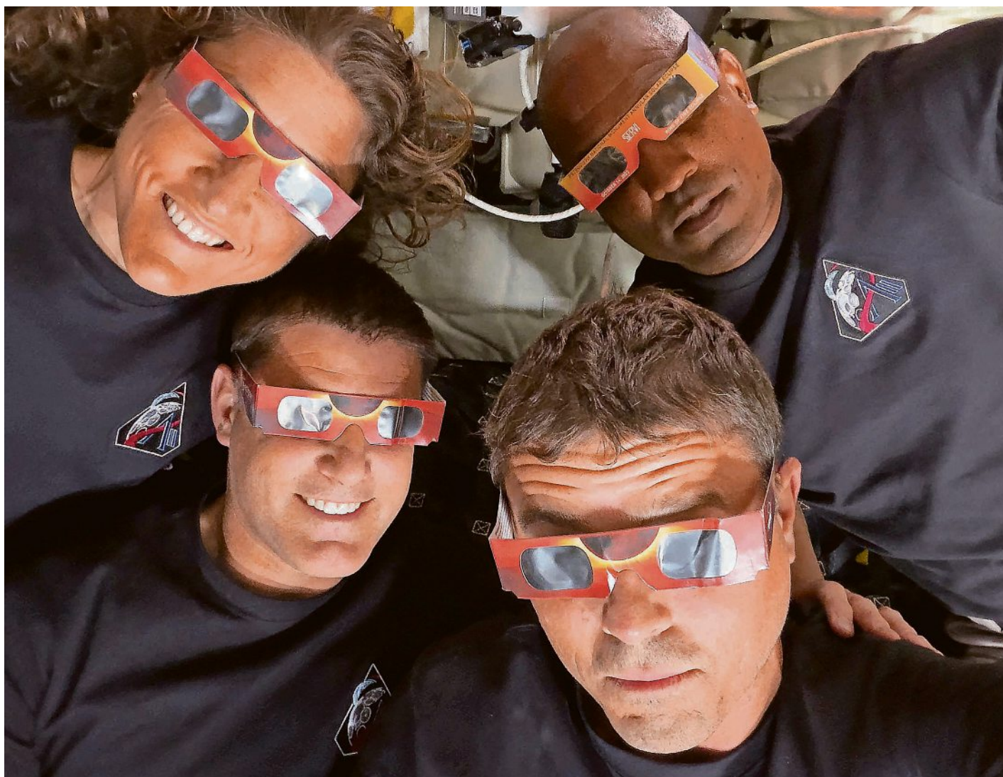
The Artemis II crew of NASA astronauts, counterclockwise from bottom right: Reid Wiseman, Victor Glover, Christina Koch and Canadian astronaut Jeremy Hansen. They will return to Earth on April 10.