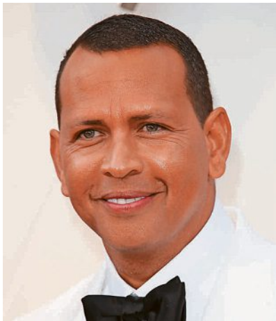
Alex Rodriguez, a three-time MVP and World Series champion, will speak at the 2025 Kroger Wellness Festival on Sept. 27.