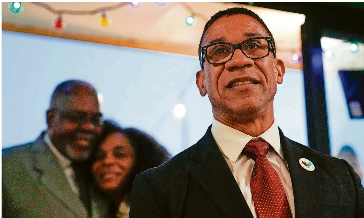
Mayor Michael Bivens speaks during a special recall election party at Flavor 91 Bistro in Whitehall on June 23.