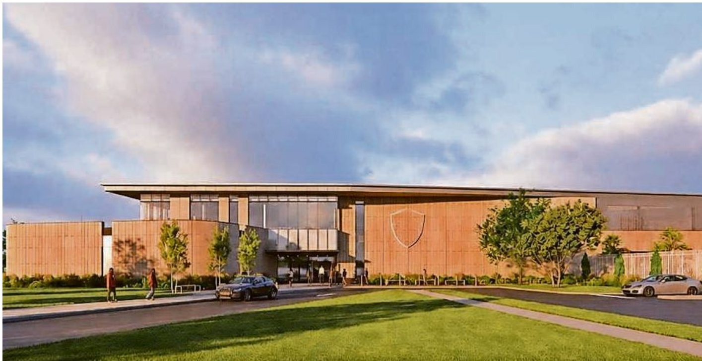
Owners of the to-be-named Columbus National Women's Soccer League team are planning to build a training facility at McCoy Park, seen in this rendering, in the city's Southwest Side. The site will include a two-story, 45,000 square-foot building, set to begin play in 2028.