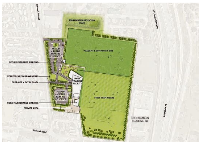
The training facility planned for McCoy Park includes 2½ high-tech, heated grass fields for the first team and three more fields for academy players and the community to use.