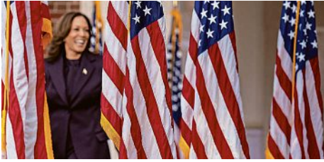
Vice President Kamala Harris lost in 2024 to Republican Donald Trump, whom she characterized on the trail as an acute threat to democracy.