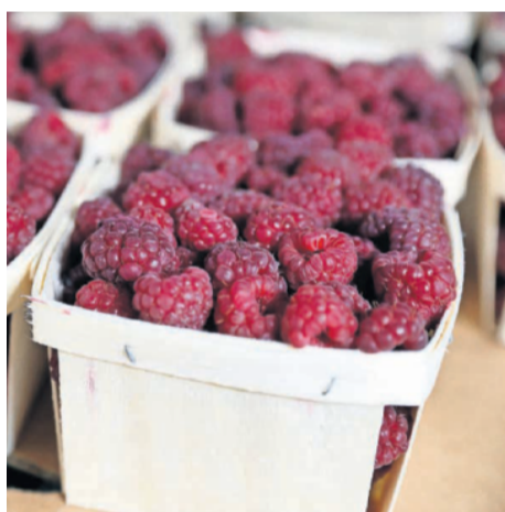
Fresh produce should be thoroughly washed before being eaten. But cyclospora can really stick to some foods, especially raspberries.

Michigan reported about 40 hospitalizations. Just across the state line, Lucas County, Ohio, reported 306 cases. North-