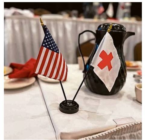
Hilton Binghamton hosted the 2026 Southern Tier Real Heroes Breakfast where community members and essential workers are recognized for their selfless acts on May 14.