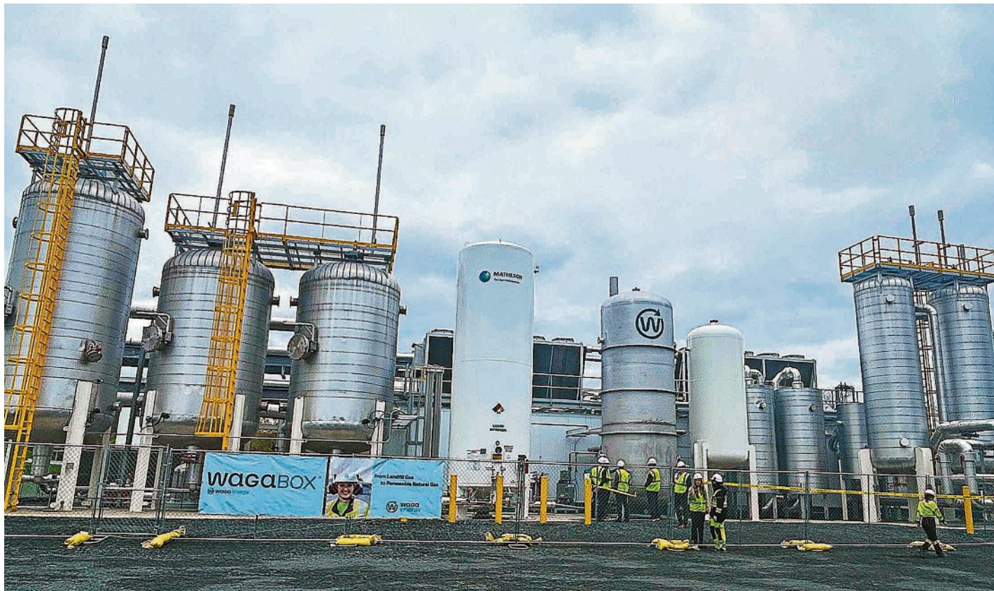
Waga Energy is partnering with Casella Waste Systems, Chemung County and Valley Energy on a new facility that can convert methane and other gases from Chemung County Landfill into renewable natural gas.