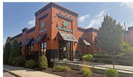
Mooney's Sports Bar & Grill, located at 214 Reynolds Road in Johnson City, is permanently closed as of Aug. 14.