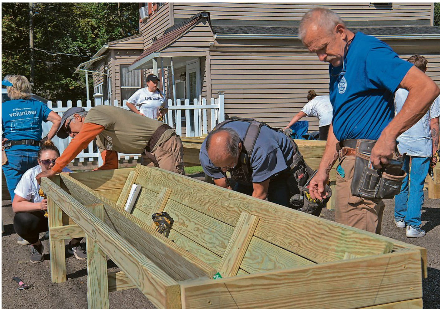
The site will have several "all access" raised garden beds, built for gardeners with limited mobility.