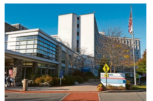
Northern Westchester Hospital in Mount Kisco Oct. 15, 2025.