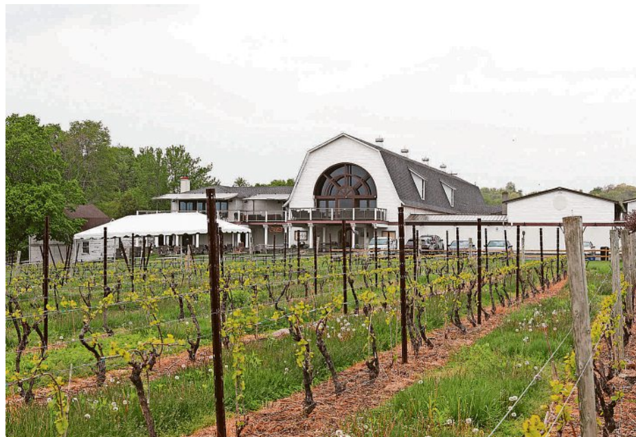
Rows of grapevines outside Millbrook Winery.