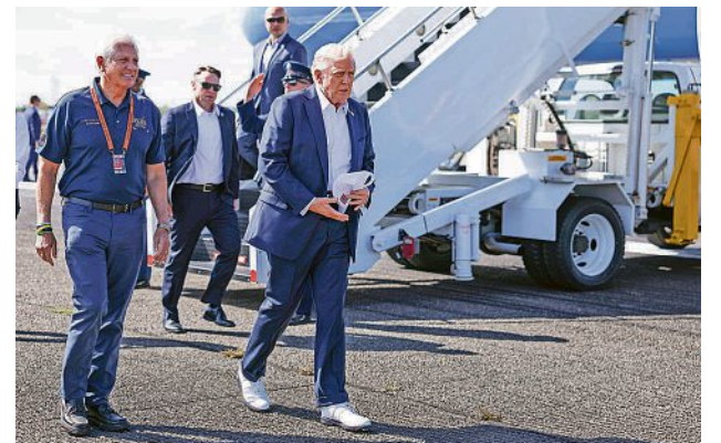
U.S. President Donald Trump walks with Bruce Blakeman, who is now running for governor of New York state, after arriving at the Republic Airport on Air Force One on Sept. 26, 2025, in Farmingdale, New York.

"Unlike Hochul, I'll actually keep my word when I'm governor: I'll cut your taxes, slash your utility bills in