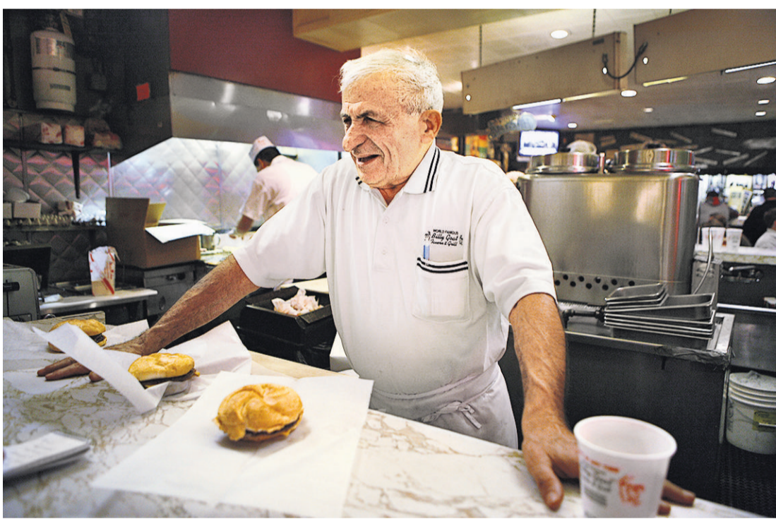
JOSÉ MORE FOR THE NEW YORK TIMES