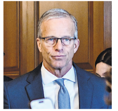
Senator John Thune of South Dakota, the majority leader.

While Republicans still plan to take up the measure when lawmakers return, the delay underscored a toxic dynamic between the White House and the G.O.P.-controlled Congress just months before the midterm elections.