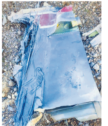
A photo provided by Iran state media claims to show part of a downed F-15E Strike Eagle. The red tail stripe is consistent with the tail section of an F-15E.