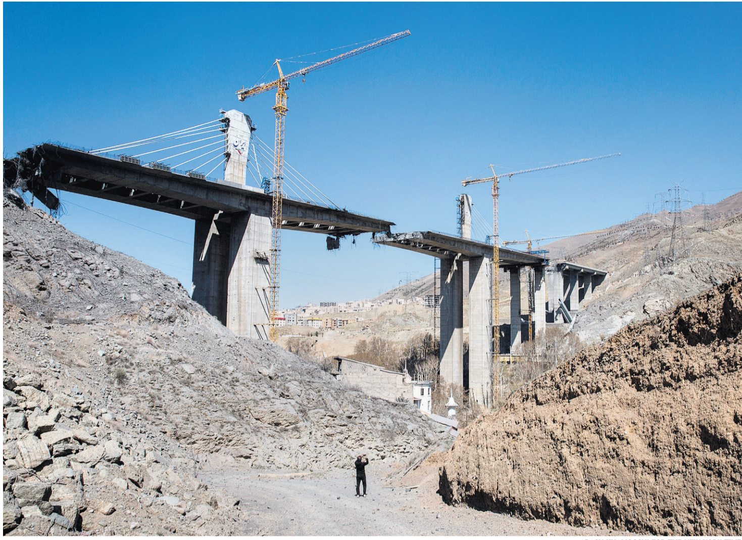
A.U.S. strike on a bridge intended to connect Tehran to the Caspian Sea left eight dead on Thursday, according to Iran state media.