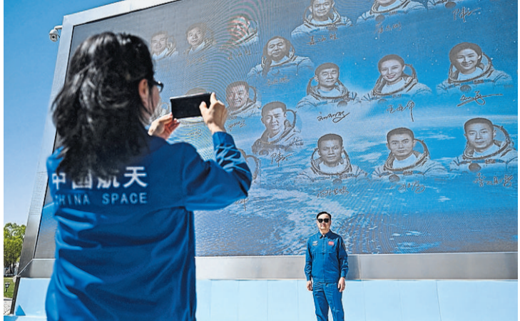
A board featuring China's astronauts at a launch center in the Gobi Desert. The program's first goal is a moonwalk by 2030.

launch missions into deep space. It is a new frontier, and whoever gets there first will have a big say in setting the rules. NASA's program, known as Artemis, has hit repeated snags. The United States wants to be back on the moon by 2028, two years ahead of China's target, but even NASA acknowledges that it may not win. "They may be early," Jared Isaacman, the NASA administrator, said last week. "And recent history suggests we might be late." China is pursuing its lunar ambitions with a singular, formidable focus. Its program has several advantages over its American rivals. Experts say China's edge lies in its centralized control, which allows it to plan and fund projects for decades at a time. Its robotic space missions have already gone where the United States has not. China is the only nation to land on and retrieve samples from the far side of the moon, the hemisphere that always faces away from Earth. This summer, China's seventh robotic mission, Chang'e 7, will explore the lunar south pole. It helps China that its immedi-