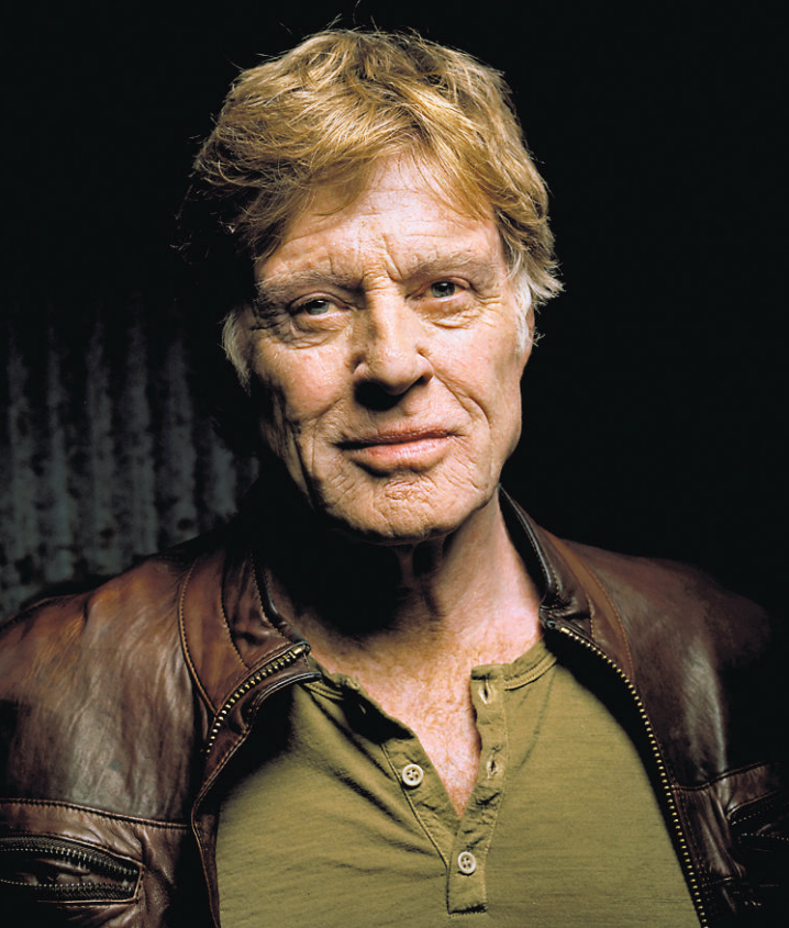
Robert Redford in 2013. “I was born with a hard eye,” he later said.