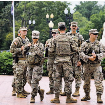
National Guard members are part of a federal crackdown.