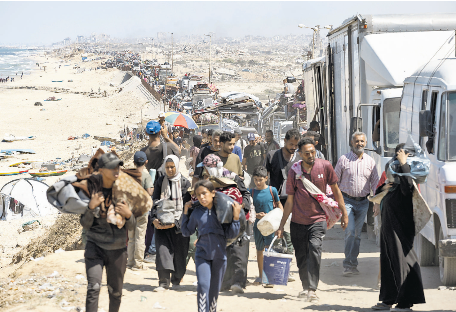
Palestinians fled their homes in Gaza City on Tuesday. About half a million people are believed to still be sheltering in the city.