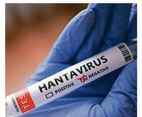
A test tube labelled "Hantavirus negative" is held in this illustration taken May 7.