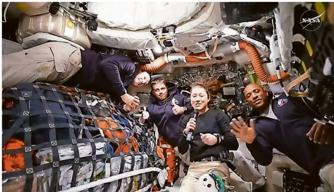
Artemis II crew members Jeremy Hansen, Reid Wiseman, Christina Koch, and Victor Glover answer questions from reporters during the first downlink event of their mission.