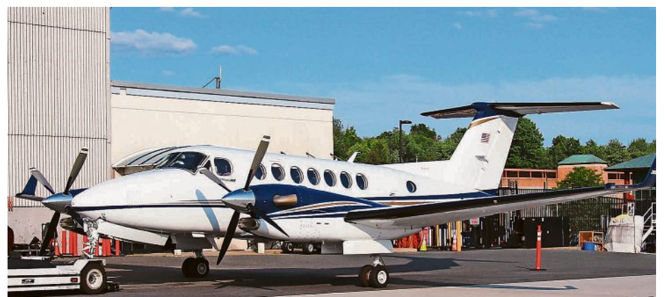
The New York Power Authority uses this $7.5 million turboprop airplane to fly executives and other personnel around New York for meetings and press conferences, often to promote climate-friendly initiatives.