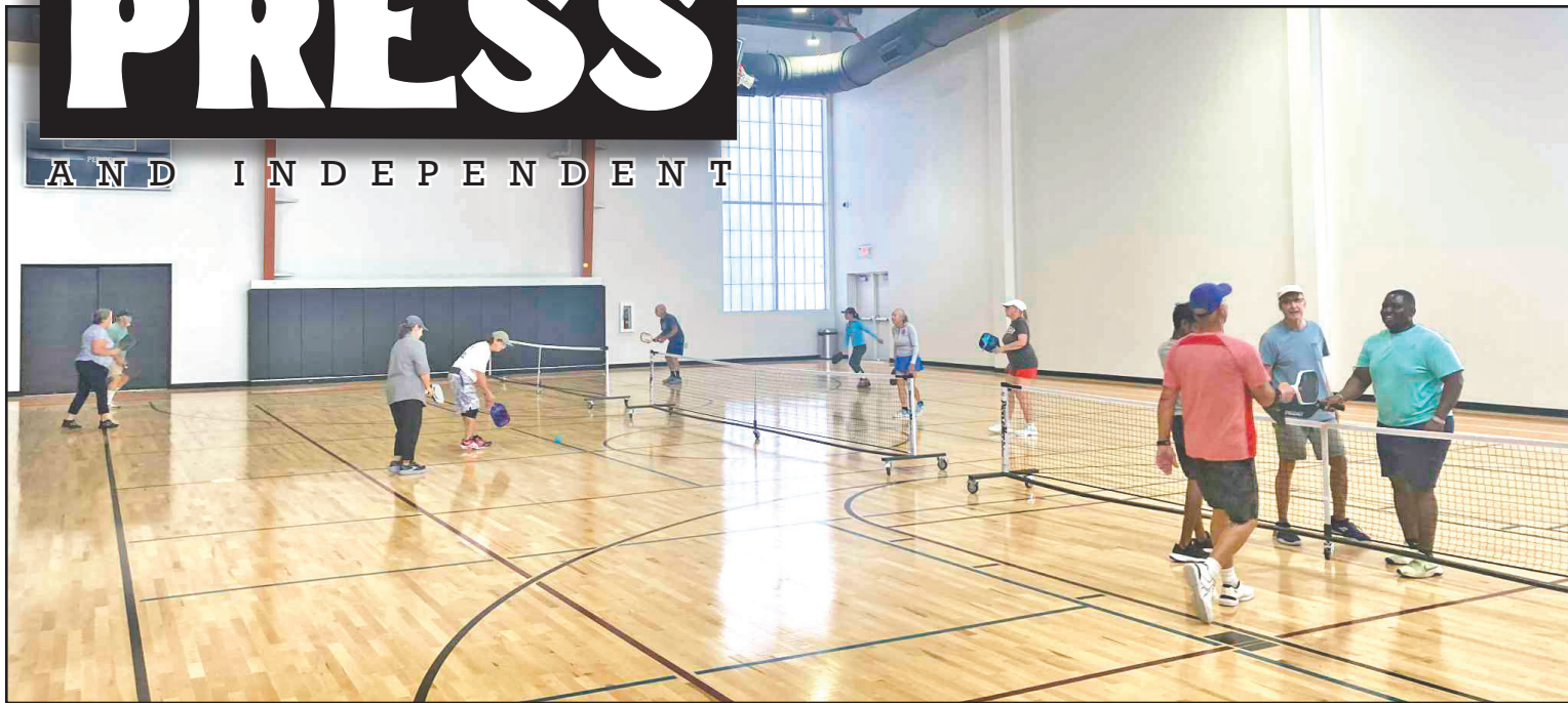
Patrons of the Henry V. "La Burra" Morales Recreation Center play pickleball on opening day Saturday.