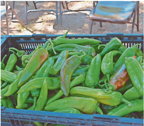
The Hatch Chile Festival is scheduled for Aug. 30 and Aug. 31 in the Village of Hatch, New Mexico.